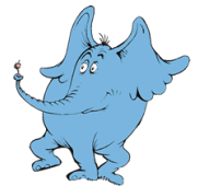
THEODOR SEUSS GEISEL